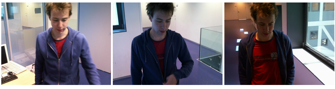
(a) frame 142